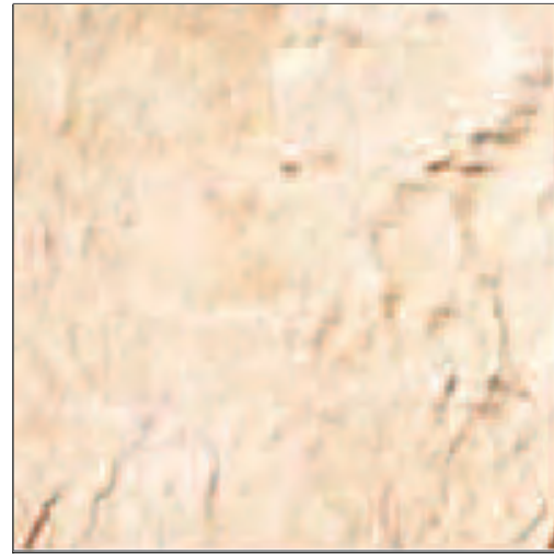
16 X 24