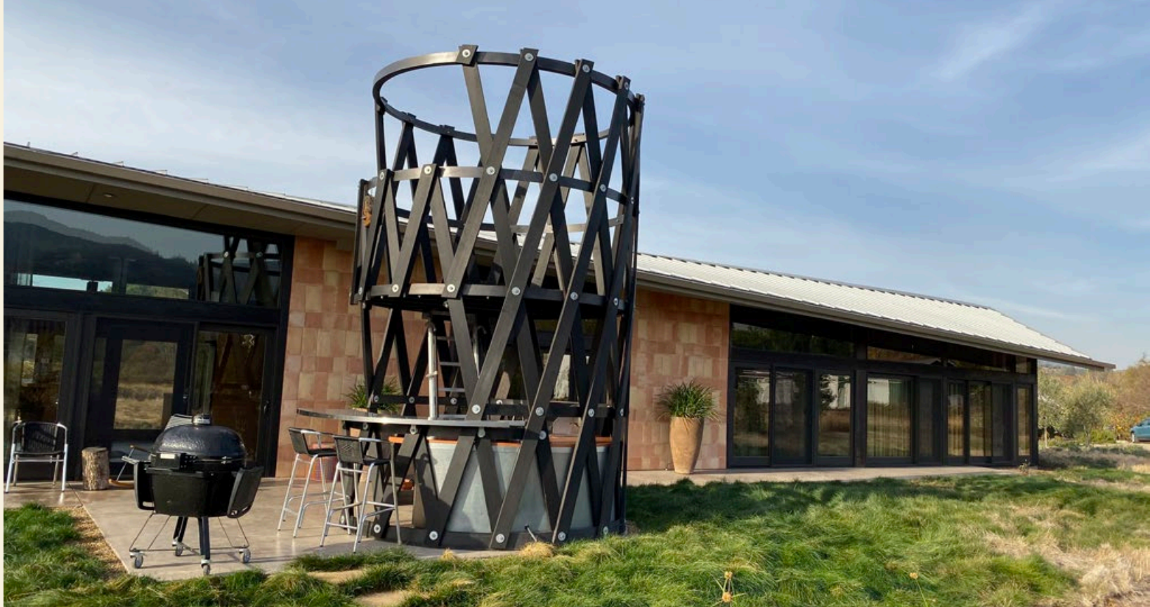
CUSTOM BBQ SILO