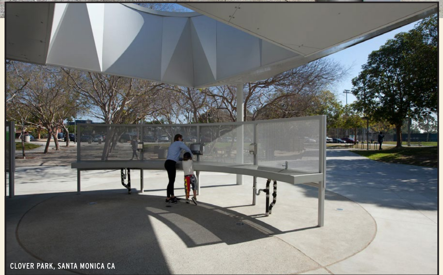
CLOVER PARK, SANTA MONICA CA